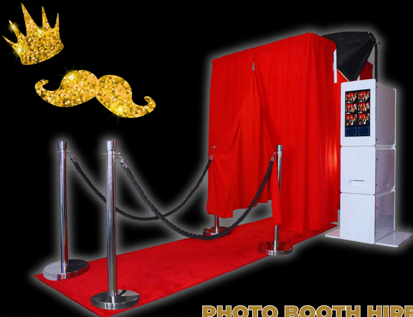
PHOTO BOOTH HIRE