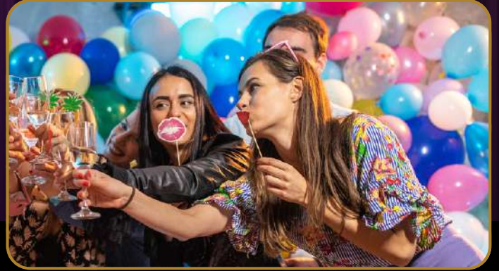
PHOTO BOOTH HIRE

Capture the Fun, Frame the Memories—Photo Booth Magic for Your Birthday!