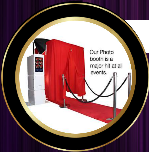
Photo Booth Hire

Make your birthday event a memorable one!