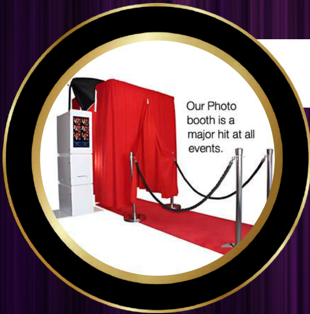
Photo Booth Hire

Make your corporate event a memorable one!