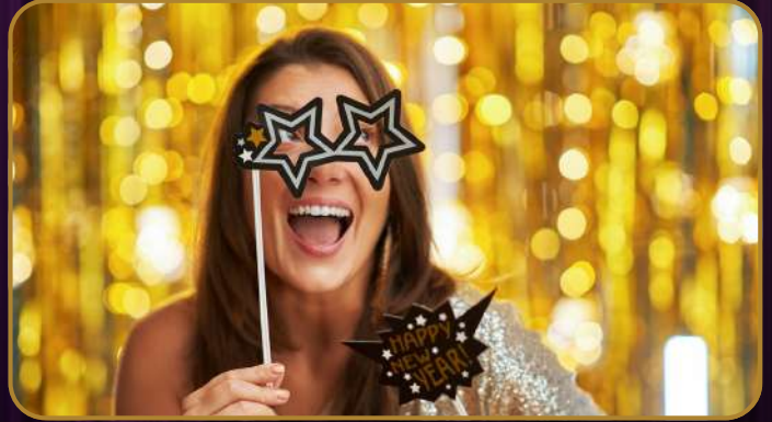
PHOTO BOOTH HIRE