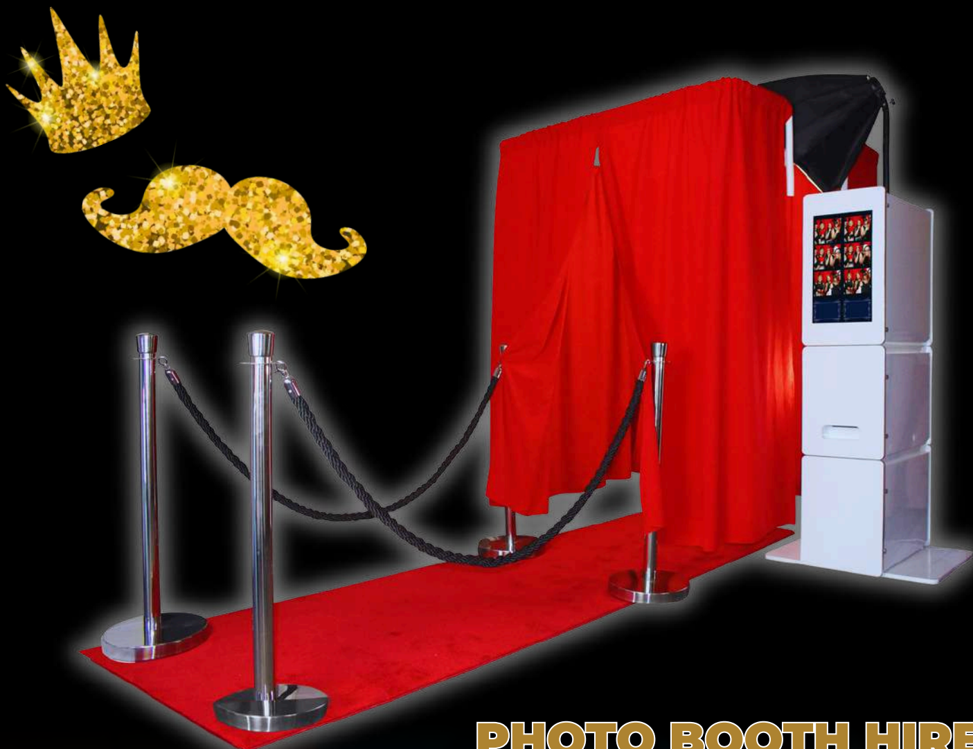
PHOTO BOOTH HIRE