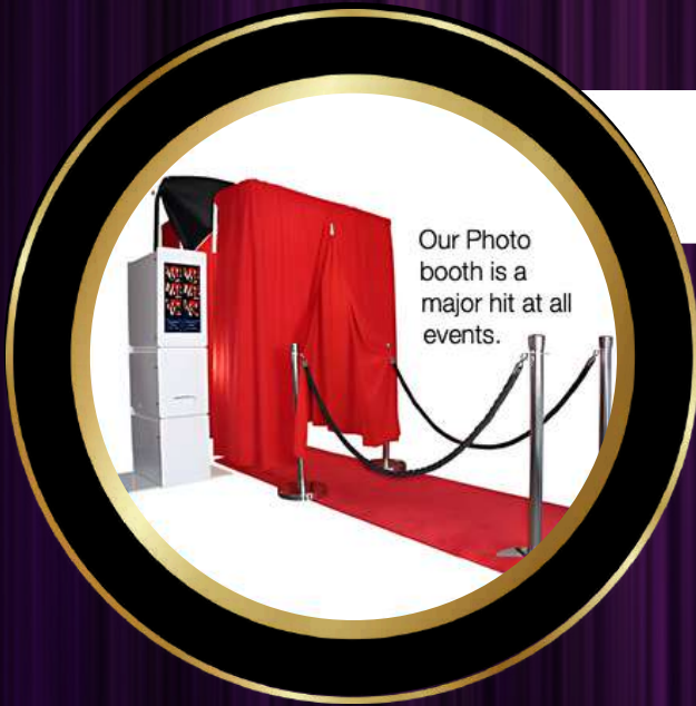
Photo Booth Hire

Make your wedding reception a memorable one!